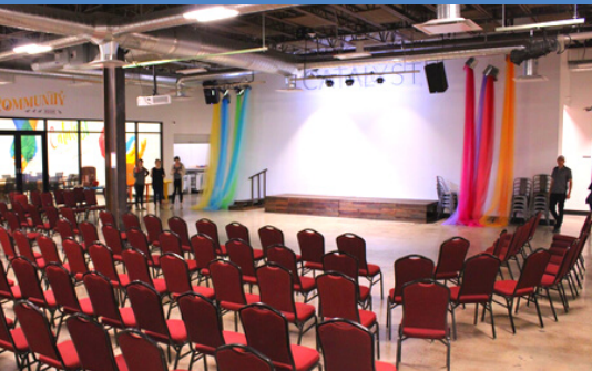
EVENT MAIN FLOOR