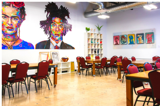
ARTS & CRAFTS STUDIO