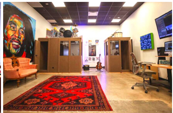
MUSIC & DIGITAL ARTS LAB