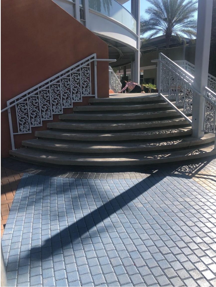
Stair Segment 2